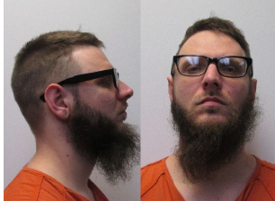
FUSON, DAVID JONATHAN

2020-00001192 03/03/2020 Male 12/07/1988 Citizen Warrant Pod Block: *Bookin Pod Block: Holding10 Bed Name: 01 Release Date: Release Reason: Brought In By Officer Brought In By Agency 01584 - Rice IN0100000 Charge Bond/Bail Amount Severest State NOUCR Warrant - Felony Warrant - Felony $505.00/$0.00 No State NOUCR Warrant - Felony Warrant - Felony $10,005.00/$0.00 Yes