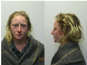
HERSHEY, SUMMER DAWN

2022-00004468 11/21/2022 Female 07/30/1991 Citizen Pod Block: *Bookin Pod Block: Female Drunk Tank Bed Name: 04 Release Date: Release Reason: Brought In By Officer Brought In By Agency 0687 - Crawford IN0100300